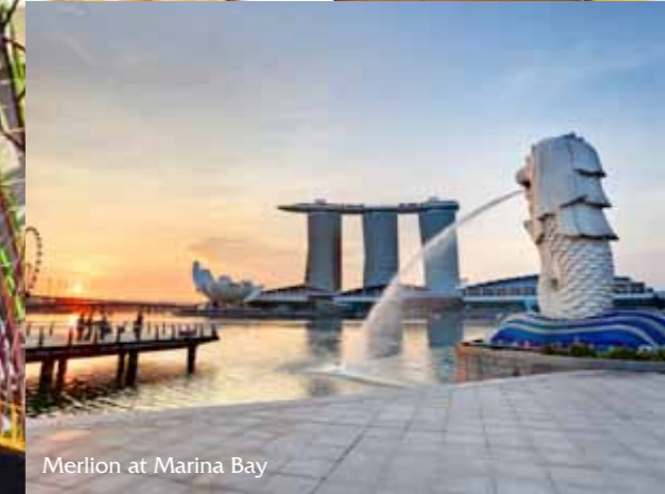
Merlion at Marina Bay