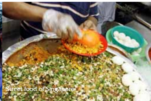
Street food of Singapore