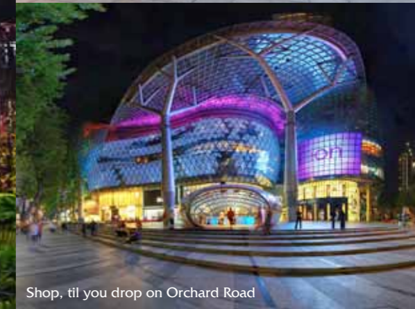
Shop, til you drop on Orchard Road