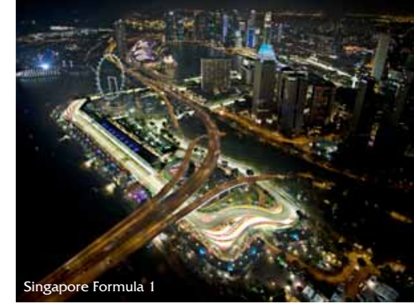
Singapore Formula 1