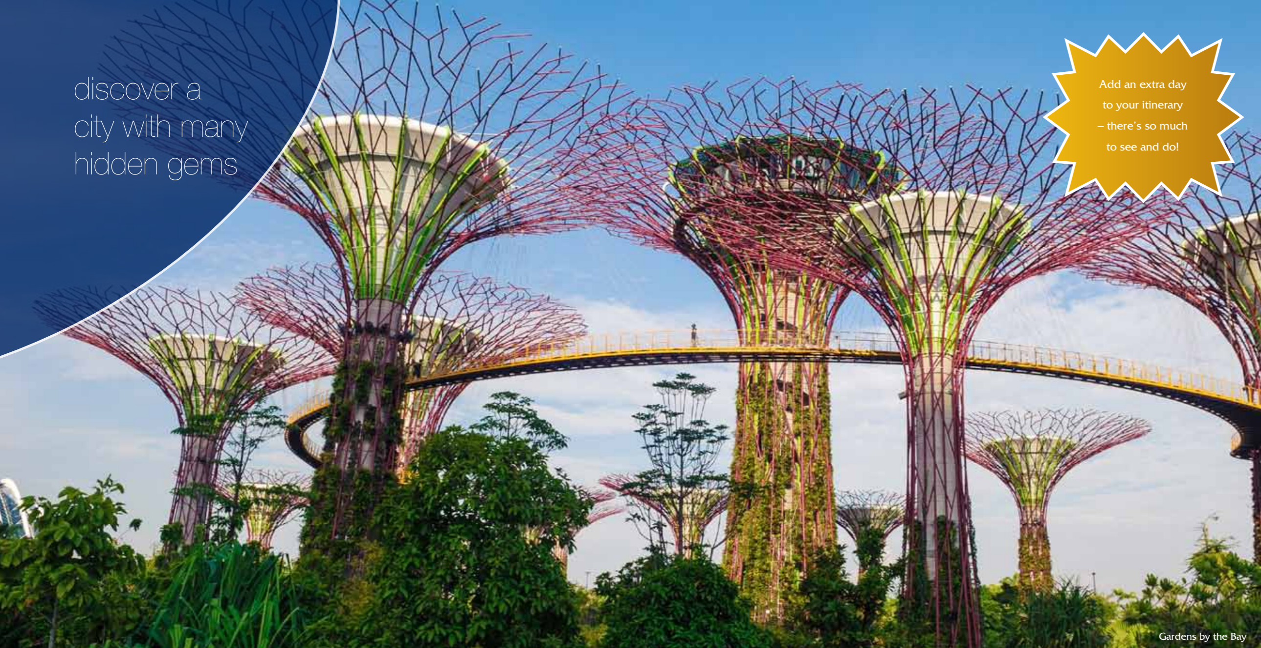
Gardens by the Bay