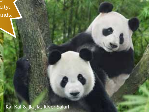
Kai Kai & Jia Jia, River Safari

Top tips Home to a myriad of flora and fauna the Southern Ridges are also one of the best spots to enjoy panoramic views of the city, harbour and Southern Islands.