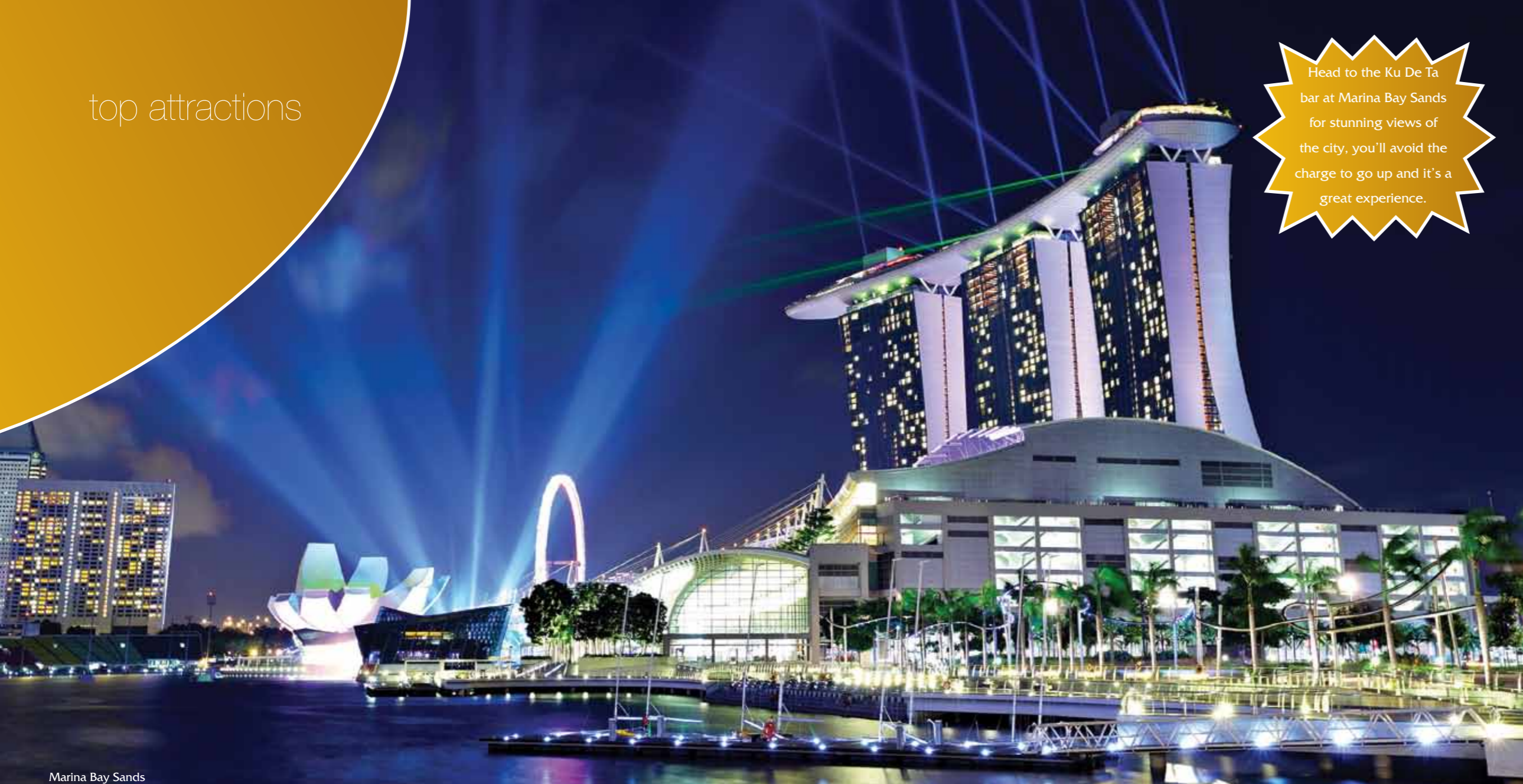
Marina Bay Sands

Head to the Ku De Ta bar at Marina Bay Sands for stunning views of the city, you'll avoid the charge to go up and it's a great experience.