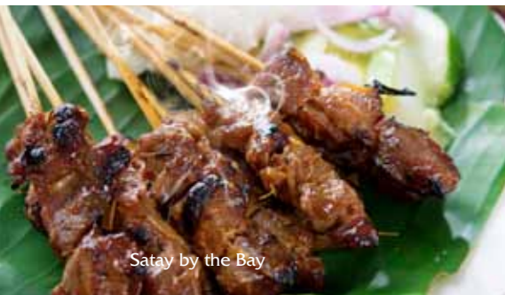
Satay by the Bay

Sitting in one of Singapore's most popular hang-out spots, Holland Village, this is the perfect setting for a romantic late night dessert. Sink back into the plush daybeds, or sit by the contoured bar to watch your dessert as it is prepared.