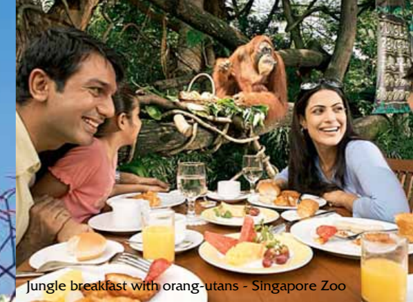
Jungle breakfast with orang-utans - Singapore Zoo

Add an extra day to your itinerary – there's so much to see and do!