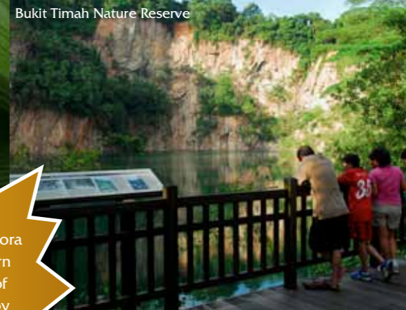
Bukit Timah Nature Reserve

Top tips Home to a myriad of flora and fauna the Southern Ridges are also one of the best spots to enjoy panoramic views of the city, harbour and Southern Islands.