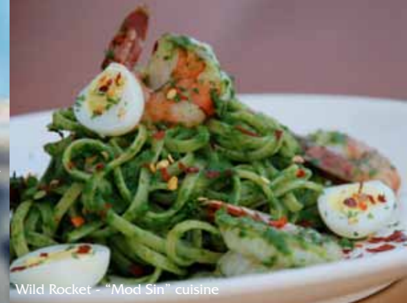
Wild Rocket - "Mod Sin" cuisine

Top Tip Head to Katong to try a bowl of the most delicious Laksa (coconut curry noodle soup) in town.