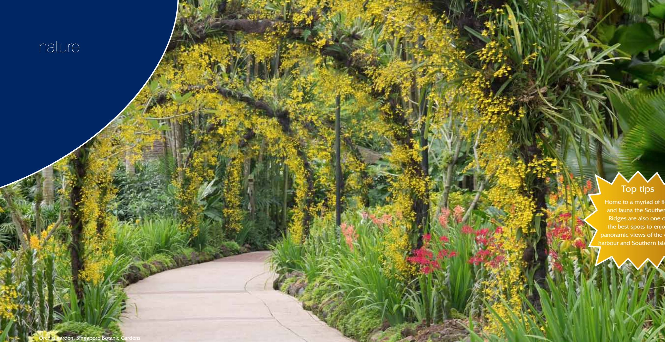
Orchid garden, Singapore Botanic Gardens