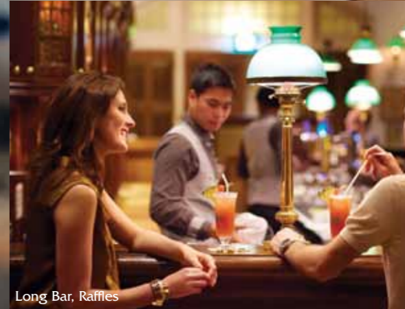
Long Bar, Raffles