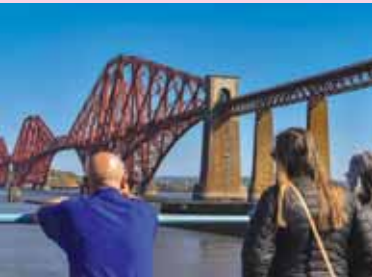
The Forth Bridge