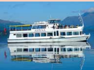
Loch Lomond Cruise