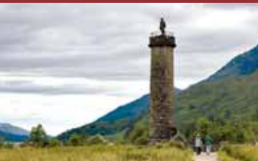
Bonnie Prince Charlie, Glenfinnan

One pick up only – outside The Elephant House, 21 George IV Bridge