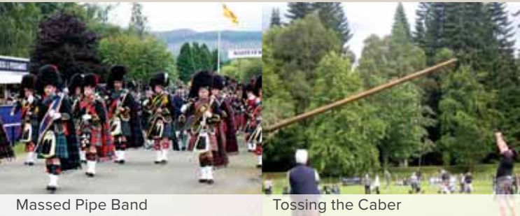
Massed Pipe Band

Leaves at 7.30am, arriving back at 7.30pm