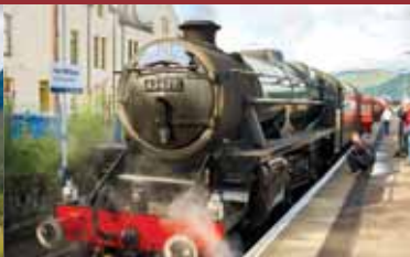
The Jacobite at Fort William

Price for transport and guided bus tour, and also includes a ride on the Jacobite train between Fort William and Mallaig. A small packed breakfast is provided (note that we are unable to cater to individual dietary requirements). Times shown are approximate.