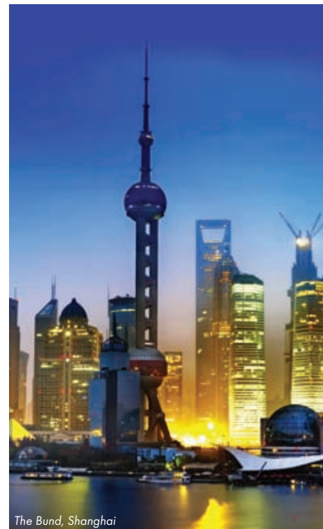
The Bund, Shanghai

Tour price: The price shown is based on the best value travel dates in low season and includes return private transfers between the airport and hotel, 2 nights accommodation and sightseeing as outlined on day 2.