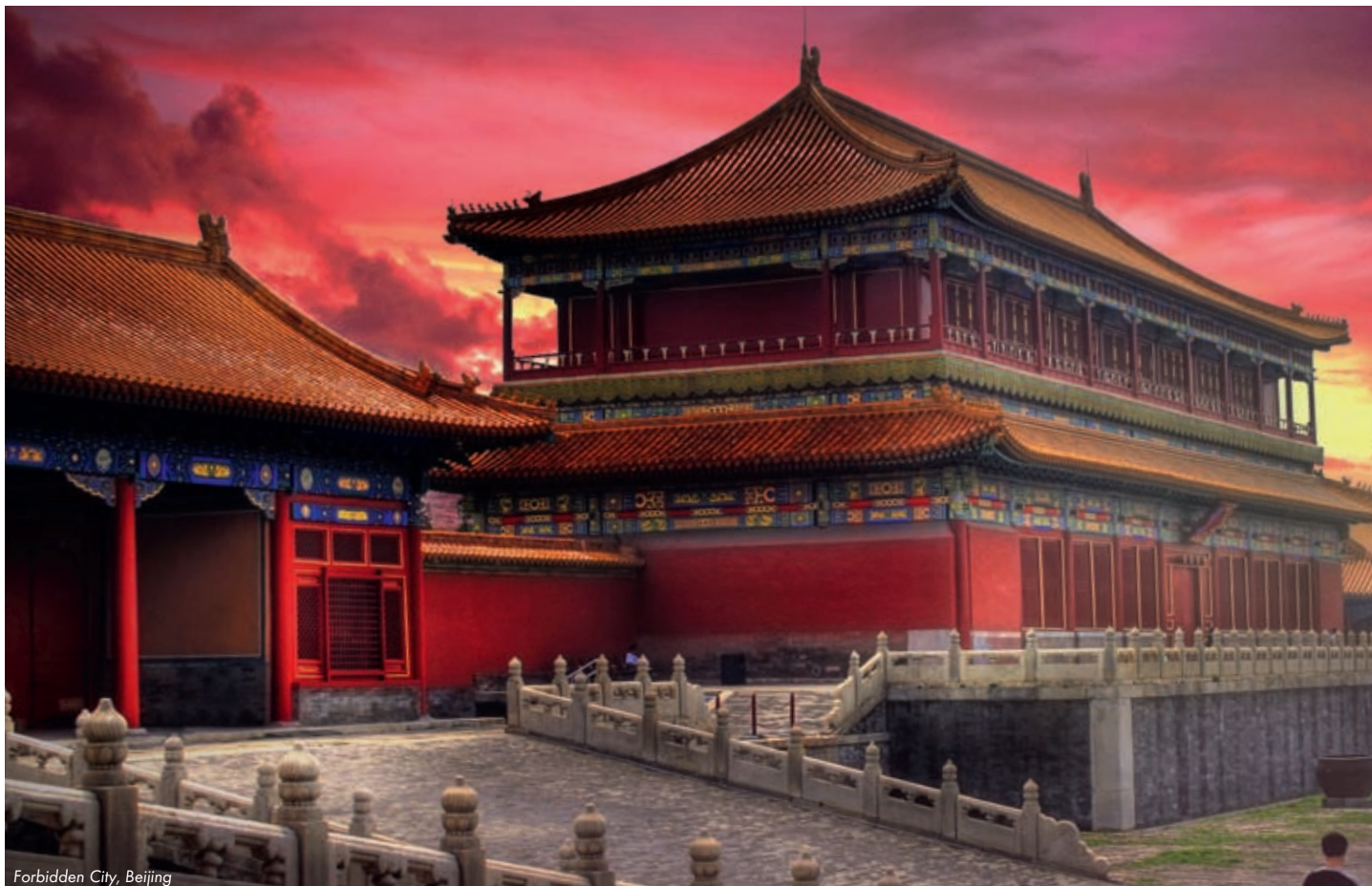
Forbidden City, Beijing