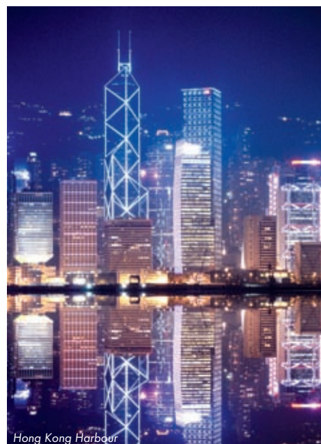
Hong Kong Harbour

In each city our tour is based on centrally located accommodation, but should you require a little more comfort or space, upgraded rooms are available at a supplement. Additional sightseeing excursions can also be pre-booked in each city. Please ask for details and prices.