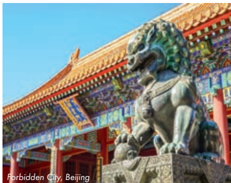
Forbidden City, Beijing