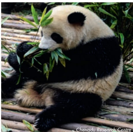
Chengdu Research Centre