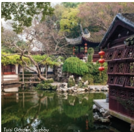
Tuisi Garden, Suzhou