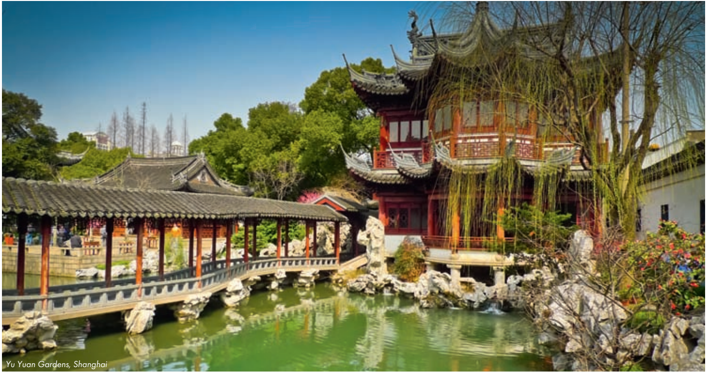
Yu Yuan Gardens, Shanghai