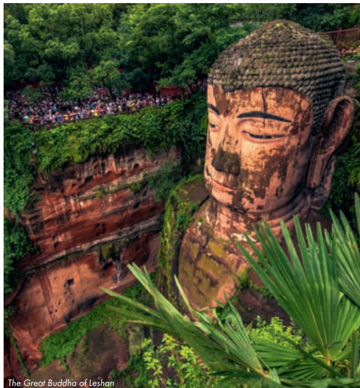
The Great Buddha of Leshan

Guides & tipping: Groups of 10 people or more will be provided with the services of a Tour Manager who will accompany the tour throughout in combination with local city guides. For your convenience, a compulsory amount to cover tips for guides, drivers and portage will be collected from you by your guide at the start of the tour (generally around £4 per person per day).