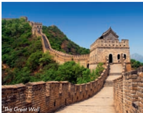
The Great Wall